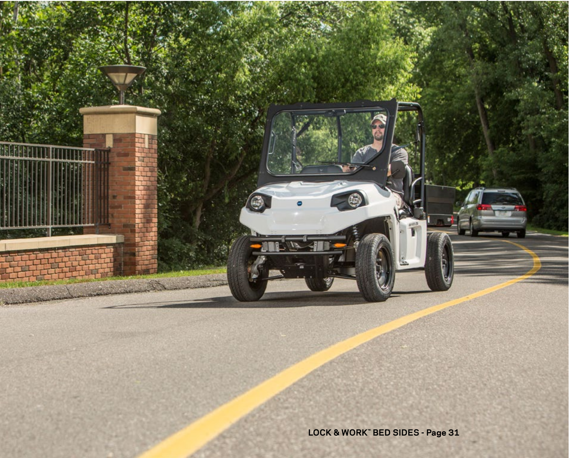
LOCK & WORK™ BED SIDES - Page 31

Haul up to 1,450lbs of payload with GEM® electric and Polaris® gas utility vehicles that can be customized to fit your specific needs.