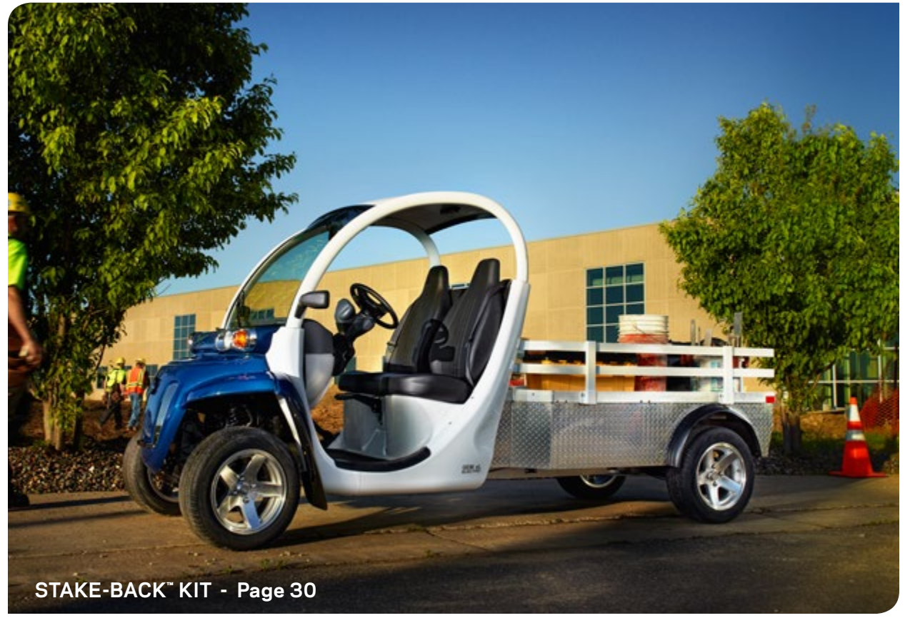
STAKE-BACK™ KIT - Page 30