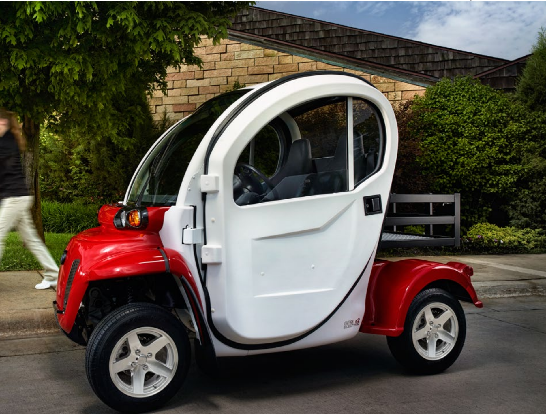
HARD DOOR KIT, COUPE - Page 18

Transport up to 6 people in car-like comfort with street legal, zero-emission electric vehicles that can be customized for almost every application.