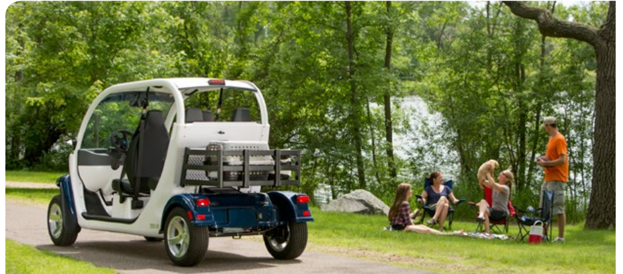
CLIP-IN STAKE-BACK™ - Page 30