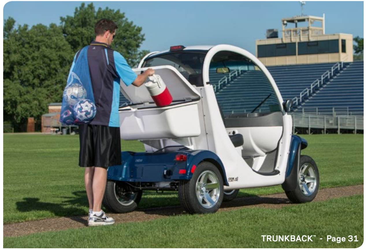
TRUNKBACK™ - Page 31